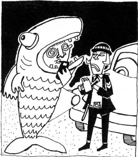
On the way home from a fancy-dress party

Why didn't I stop at the traffic lights? I wish I had stopped at the traffic lights.