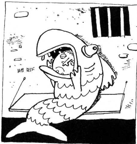
The morning after the night before

2 Complete the sentences by putting the verbs in brackets into the appropriate tense.