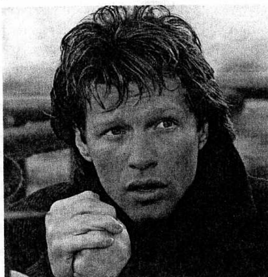
(Adapted from Candice, October 1997)

That I'm not out on the town every night. When I was in London filming, I would drive to work at 6 am and see people coming out of the clubs and feel thankful that I'd had a good night's sleep. I'm all for going out on a bender now and again, but you can't do it every night.